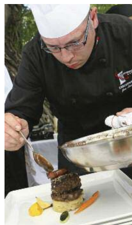
Set Sail for Hope (Hanlan's Point, Toronto Islands, July 2008)